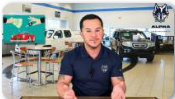
Learn The Sales Process