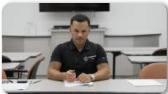
The New Generation Wants Different